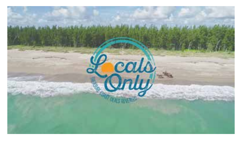
Special discounts for horseback riding on the beach are featured in the Locals Only campaign.

Visit St. Lucie recently launched their Locals Only campaign—a multimedia campaign featuring exclusive offers and deals from hotels, attractions, and activity-based businesses that are redeemable only to residents of St. Lucie, Indian River, and Martin counties. This campaign aims to foster a deeper connection with the local community, especially new residents. From discounted hotel stays at oceanfront properties to BOGO admission tickets at local attractions, all of the offers are tailored to generate demand during times that need it most, such as weekdays. VisitStLucie.com