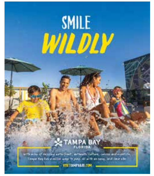
The campaign creative highlights major attraction partners including Busch Gardens® Tampa Bay, The Florida Aquarium, and ZooTampa at Lowry Park.

be customized to the diverse audiences in each target market, ranging from partnerships with local broadcasting companies to vivid imagery on digital billboards. VisitTampaBay.com