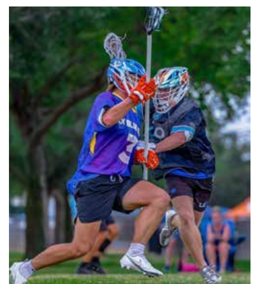
Florida Blast Lacrosse relocates to the Highlands County Multi-Sports Complex in Sebring.

Sebring and joins the growing list of lacrosse events, including USA Lacrosse, that are making the Highlands County Multi-Sports Complex their home. The event brought 5,000+ people to Sebring and created a $1.5 million economic impact. Event organizers credit the excellent conditions of the flat fields and sports complex, as well as the budgetfriendly destination's central location and hospitality for the