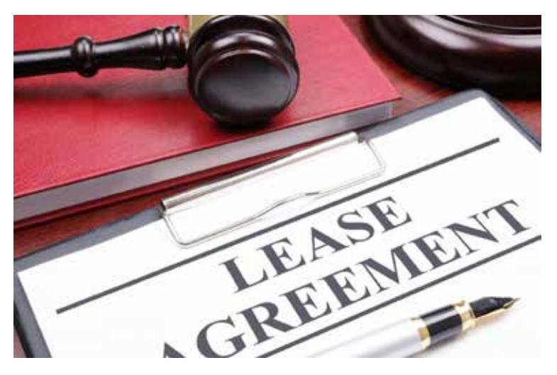
If you have office space that you sublease to another tenant, is that sublease subject to commercial rental tax? The answer is maybe !

Today we take a diversion into other Florida tax issues to address something you may come across in your operations. The question is this: If you have office space that you sublease to another tenant, is that sublease subject to commercial rental tax?