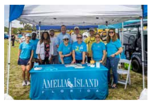
Amelia Island CVB celebrates NTTW at the annual Opening of the Beaches.

Florida's Sports Coast's fourth annual Tourism Banquet underscored another year of robust growth and achievement with an attendance of more than 400, up from 150 in 2021. FSC reported a visitor rate of 1,491,700, coupled with an economic impact totaling $1,026,067,300, and the DMO presented the inaugural Florida's Sports Coast Foundation Scholarship. A highlight of the evening was the keynote address delivered by former NFL quarterback Tim Tebow. A captivating drone show provided a dazzling finale.