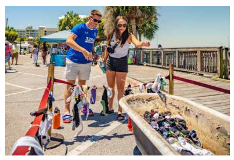
Feet are free! Event-goers toss their socks into the flames, ushering in warm days and calm waves in Panama City.

The 27<sup>th</sup> annual Blessing of the Fleet & Sock Burning Festival marked the arrival of flip-flop season in Panama City. Nearly 50 boats paraded by the St. Andrews Marina, a tradition honoring fallen seafarers and seeking safe journeys for future voyages. The festivities culminated in the symbolic sock-burning ritual welcoming flip-flop season as residents "freed their feet" by tossing their socks into the flames. DestinationPanamaCity.com