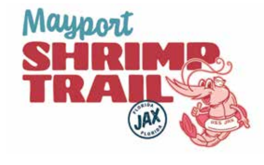
Mayport Shrimp Trail is Visit Jacksonville's newest food trail.

A small fishing village where the Atlantic Ocean meets the St. Johns River, Mayport is home to one of the best spots to catch appropriately named Mayport Shrimp. It's become Jacksonville's