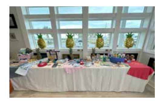
Mexico Beach celebrates NTTW with their annual Punch on the Porch.

The Daytona Beach Area CVB celebrated NTTW with its third annual Visitors' Choice Awards, which recognizes businesses and attractions that vacationers enjoyed the most in the destination. The program honors visitors' most beloved attractions and businesses through a survey that was sent to thousands of Daytona Beach area visitors in the CVB's database. Honorees included Volusia County Beaches, Daytona International Speedway, Ponce Inlet Lighthouse, and Museum of Arts & Sciences.