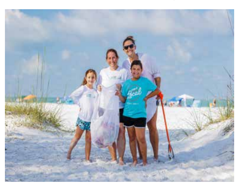
Community members participate in the Love it Like a Local Beach Clean Up.

Tied to the destination's Love It Like a Local initiative, the Bradenton Area CVB and nearly 100 volunteers worked together to preserve the sugar-white sand beaches and turquoise waters the region is renowned for. Volunteers came from as far as Germany to participate in the beach cleanup, learning how to respect local waterways and wildlife while on vacation. The Love It Like a Local initiative promotes responsible and sustainable travel while in the Bradenton Area. BradentonGulfIslands.com