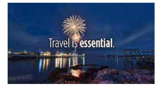
Levy County Visitors Bureau shares the importance of tourism during NTTW.

Here is a sampling of NTTW events held in Florida: