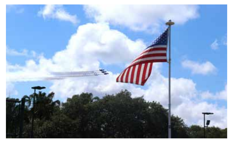
The Blue Angels perform at the Vero Beach Air Show every other year. The air show is held at the Vero Beach Regional Airport and presented by Piper Aircraft, Inc.

The Blue Angels flew into Vero Beach and attracted many visitors and locals to enjoy the amazing show at the annual Vero Beach Air Show held May 3-5, filling the skies with the sights and sounds of the awe-inspiring navy jets. Besides the Blue Angels, the Vero Beach Air Show featured many other air show acts, activities for kids, food vendors, cargo plane tours, interactive activities, and meet-and-greet opportunities with pilots. It also featured an amazing fireworks show at the Friday evening event. VisitIndianRiverCounty.com