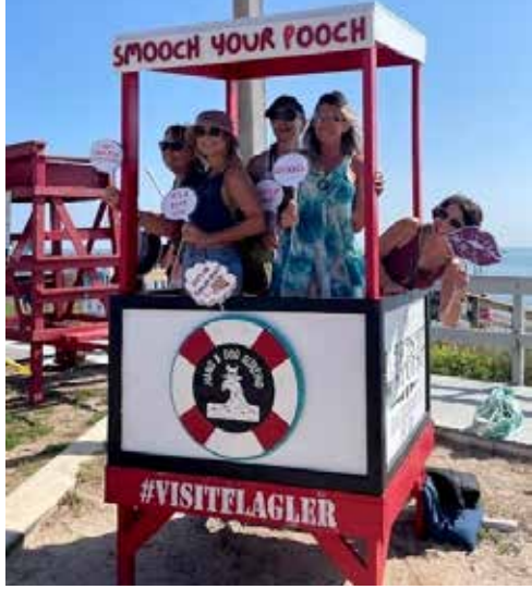
Spectators snap a group photo in the dog-kissing photo booth, sponsored by Palm Coast and the Flagler Beaches.

Palm Coast and the Flagler Beaches sponsored a kissyour-pup photo booth at the third annual Hang 8 Dog Surfing Competition in June. Spectators snapped photos with their pets in the booth and were invited to share their pics on social media using #VisitFlagler. The event, which featured small and large dog surf heats and a dog costume contest, raised money for local charities and received national